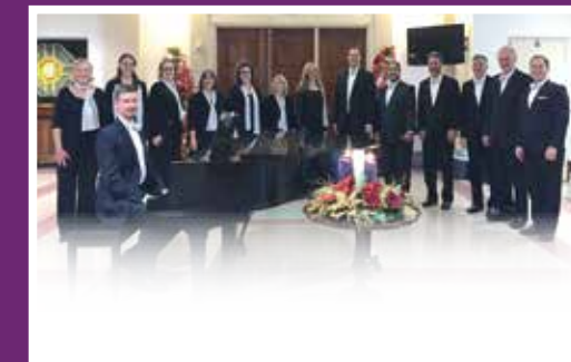
FBCSA CHAMBER SINGERS March 21, 2017 Unity Hall